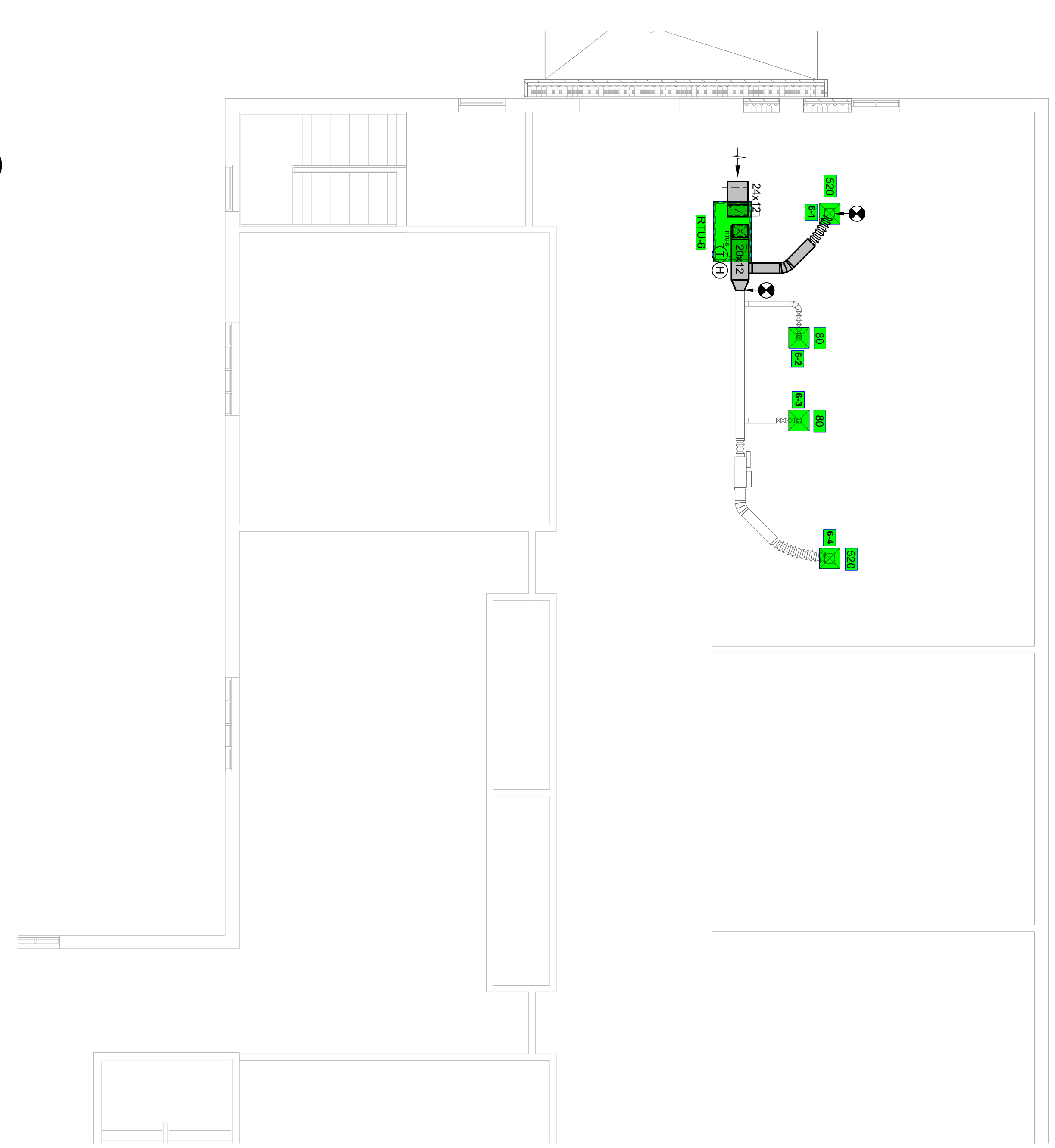
1 SECOND FLOOR PLAN - HVAC 1/8" = 1'-0"

SWYGERT & ASSOCIATES CONSULTING ENGINEERS 1015 Sargent Assoc., Ltd. Telephone: (803) 794-4300 Columbia, SC 29211 mail@swygertandassociates.com