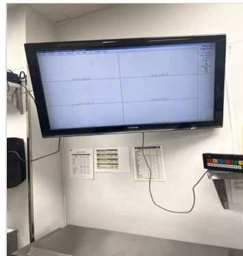
C968A180_BFB0_4AA9_9 D2D_DF58CA9C4327.jpe g