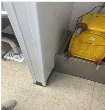
4ACFBABE_4D38_4DC7_ BE50_D9F795F95CC2.jpe g