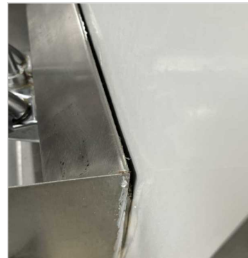
9A576D1D_70B6_49A0_ A63D_A29DCF4F5996.jpe g