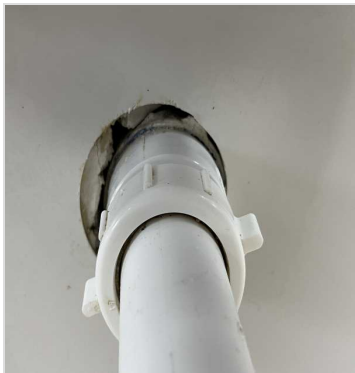
5E1AD0F1_47D1_48AA_ A423_CB37A2CD7447.jp eg