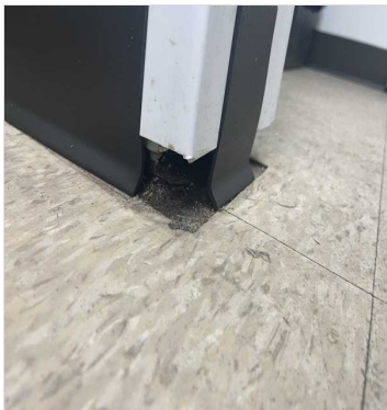
74A0416A_872B_444C_B DBE_D978DC8F5BA5.jpe g