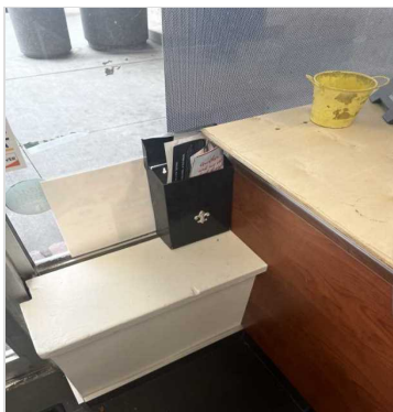
234CF478_81A9_4DA7_9 DB6_D0BDF1D783C0.jpe g