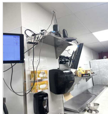
18977C8D_C836_447C_B 9BA_BBC402E4AC25.jpe g