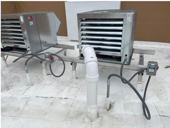
IMG_9391 John Connett Nov 22, 2024 1:00 PM