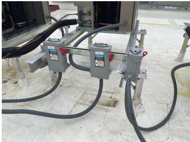
IMG_9390 John Connett Nov 22, 2024 1:00 PM