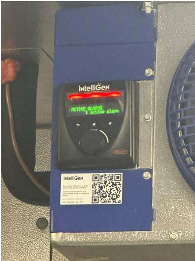
IMG_1035 Ben Searles May 8, 2025 2:43 PM