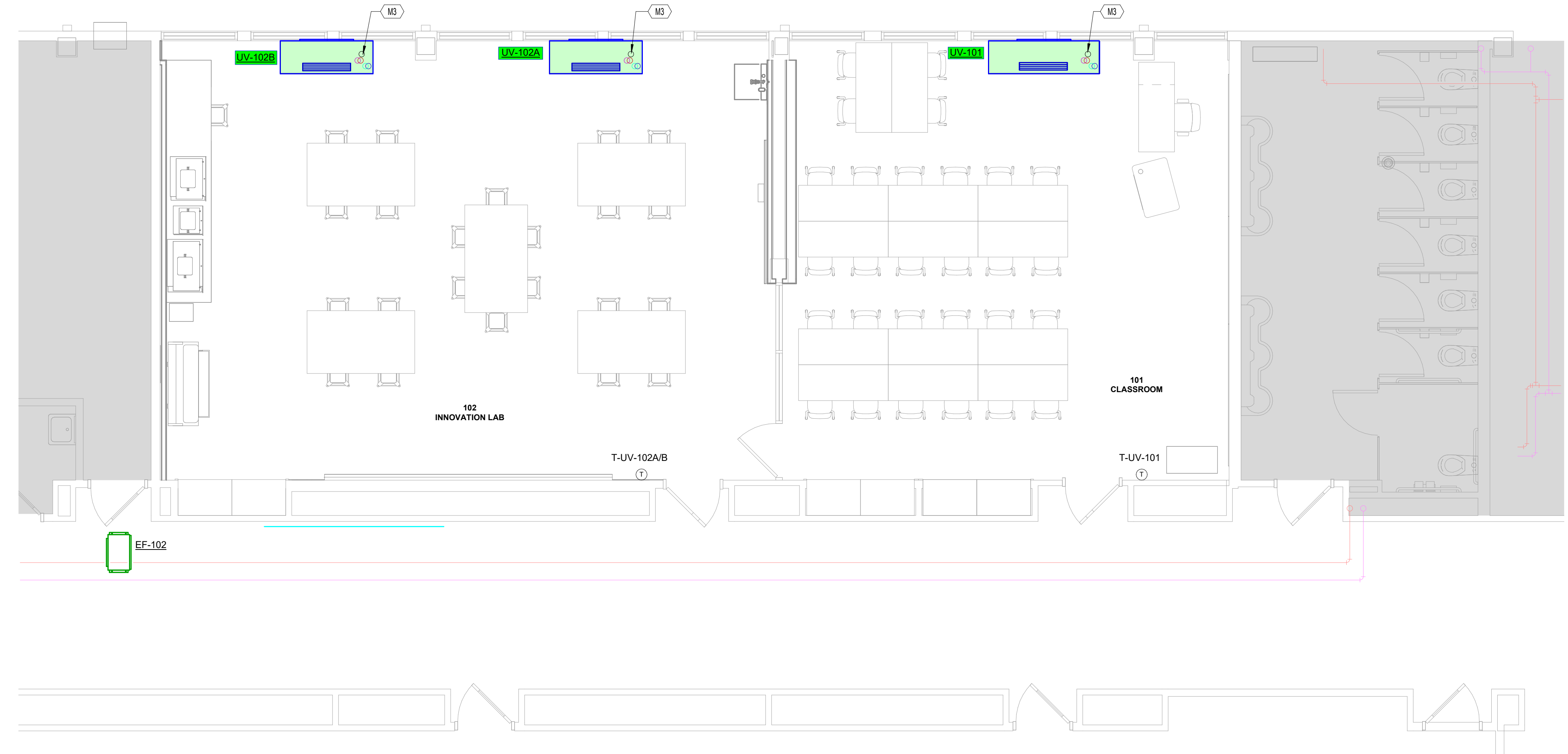
1 FIRST FLOOR HVAC PIPING PLAN M201 1/4" = 1'-0"