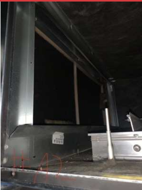
AHU-2 FILTERS ARE EXTREMELY DIRTY