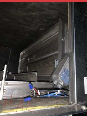
TYPICAL AHU OA AND RETURN DAMPER

If there is a mechanical stopper on the damper it is not accessible due to being butted up against the outside of the unit