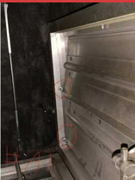
AHU-1 OA DAMPER STOPPED BY SELF TAPPING SCREWS

If there is a mechanical stopper on the damper it is not accessible due to being butted up against the outside of the unit