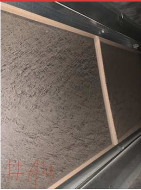
AHU-4 FILTERS ARE DIRTY