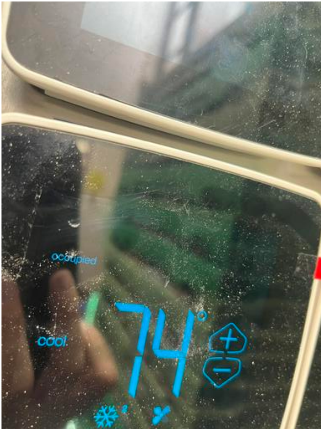
IMG_8182 Ian Fuller Aug 22, 2024 5:00 PM