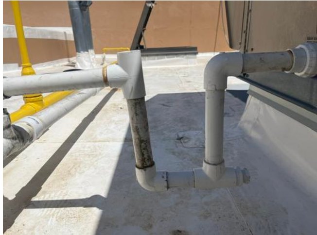
IMG_8138 Ian Fuller Aug 22, 2024 5:02 PM