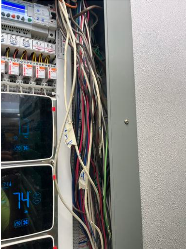
IMG_8180 Ian Fuller Aug 22, 2024 5:00 PM