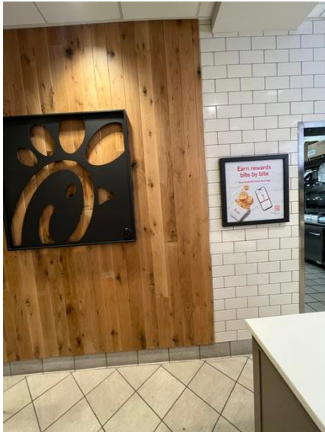
IMG_8192 Ian Fuller Aug 22, 2024 5:00 PM