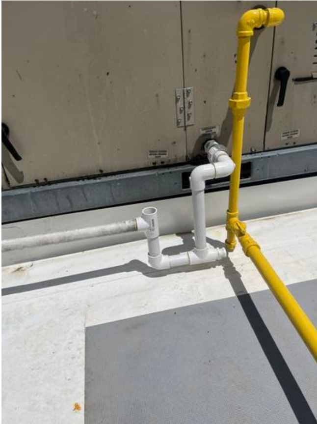
IMG_8145 Ian Fuller Aug 22, 2024 5:02 PM