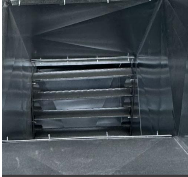
dtv - 2