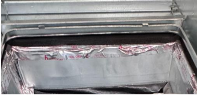
5916 - duct alignment 3