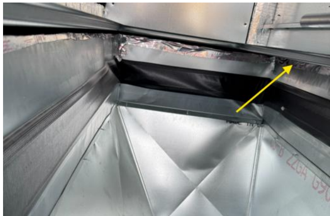
5916 - duct alignment 4