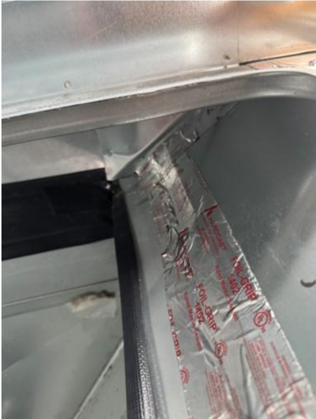
5916 - duct alignment 5