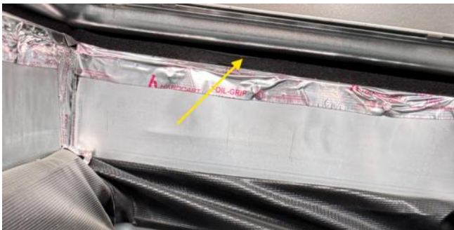
5916 - duct alignment