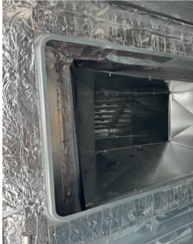
5916 - duct alignment 2