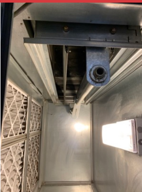
RETURN SIDE AIR DAMPER

DOES NOT HAVE A MOTOR ATTACHED. DAMPER IS LOCKED INTO PLACE