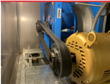
BELTS ARE IN GOOD CONDITION

DOES NOT HAVE A MOTOR ATTACHED. DAMPER IS LOCKED INTO PLACE