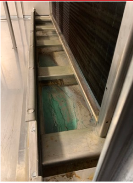
OXIDATION IN THE CONDENSATE PAN