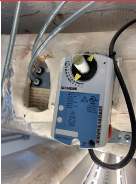
DAMPER POSITION APPROXIMATELY 50%