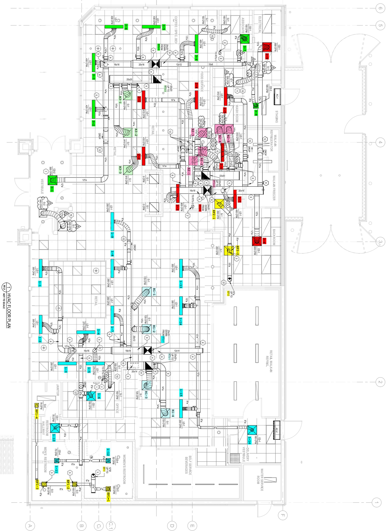
1 HVAC FLOOR PLAN (REV) NOT TO SCALE