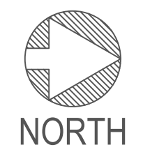
TRANSCENDIA MAKUP AIR DUCTWORK | 1 SCALE: 1/8" = 1'-0" | M100