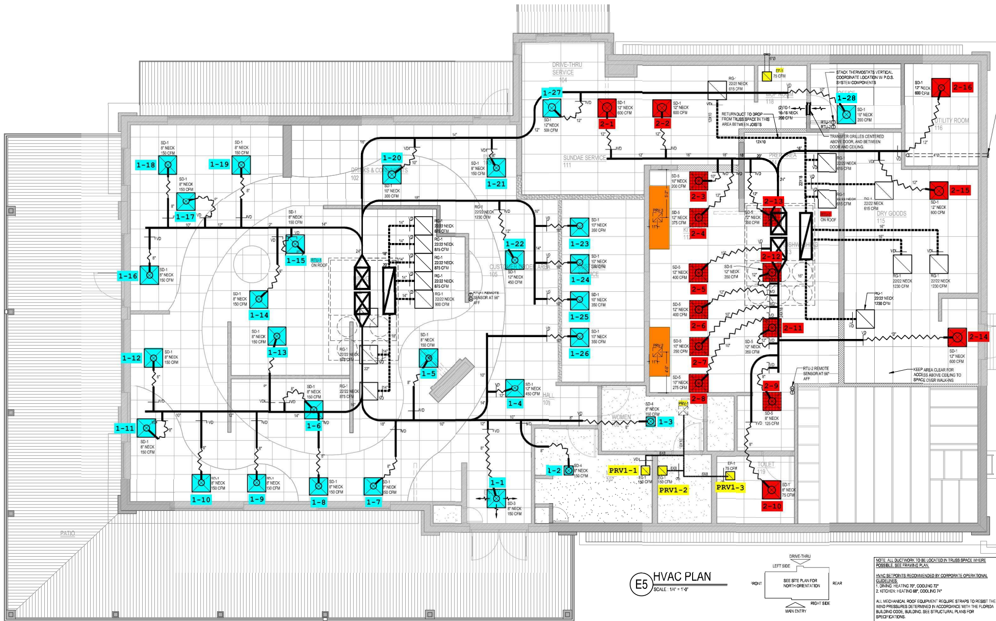
E5 HVAC PLAN SCALE: 1/4" = 1'-0"