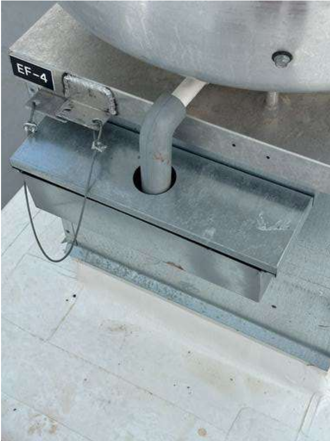
IMG_1151 Ben Searles May 17, 2025 4:45 PM