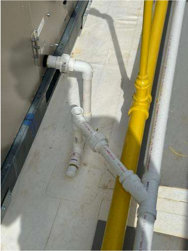
IMG_1117 Ben Searles May 17, 2025 4:46 PM