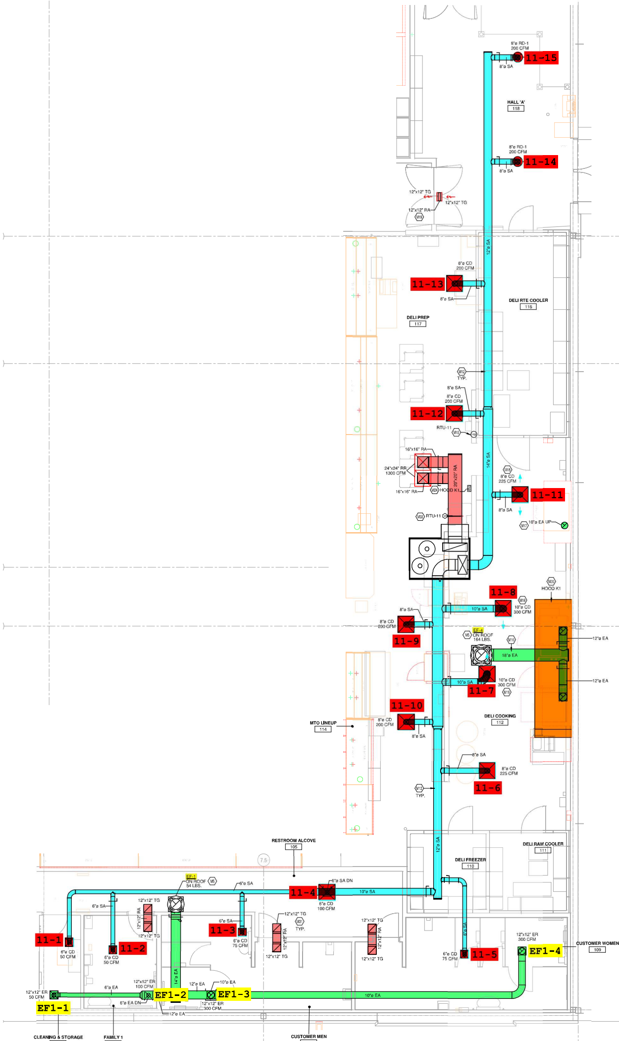
① HVAC ENLARGED PLAN - DELI 1/4" = 1'-0"

NOT A. CONTRACTOR TO RETURN DUCT OF ORDERING SHEET SUBMITTAL CON SHOWN WILL ALL DROPS TO FALL TO STRUCTURAL DIMENSIONS. CO DISCREPANCIES.