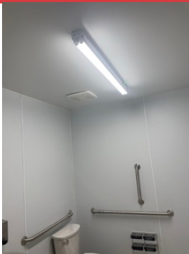
EF2 Unit picture