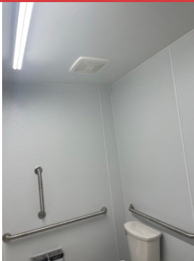
EF1 Unit picture