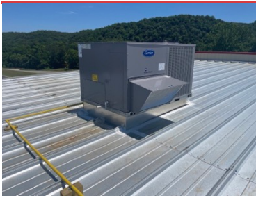
RTU4 Unit picture