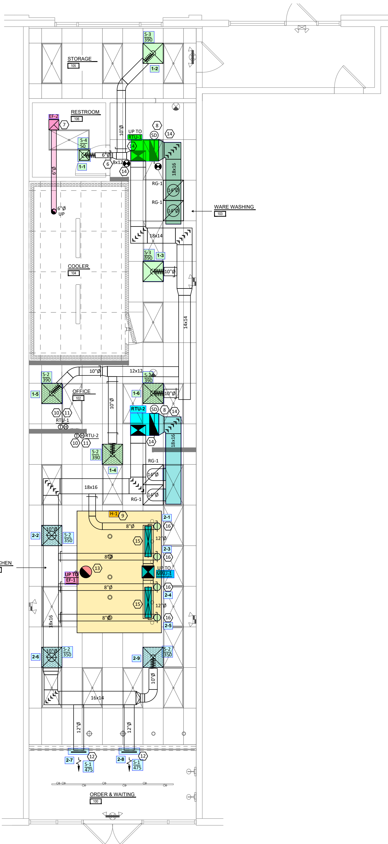
01 MECHANICAL PLAN M2-1 1/4" = 1'-0"