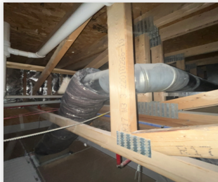
Ductwork above restroom.. 07/19/2023