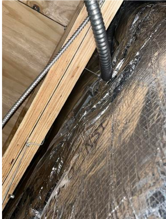
IMG_7403 Dale Wheeler Mar 31, 2025 8:33 AM