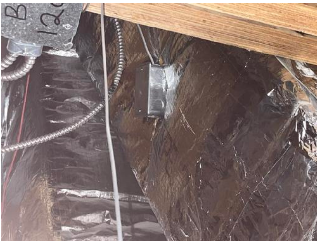
IMG_7402 Dale Wheeler Mar 31, 2025 8:33 AM