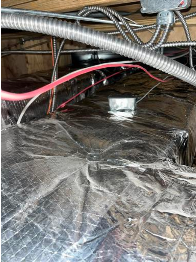
IMG_7401 Dale Wheeler Mar 31, 2025 8:33 AM