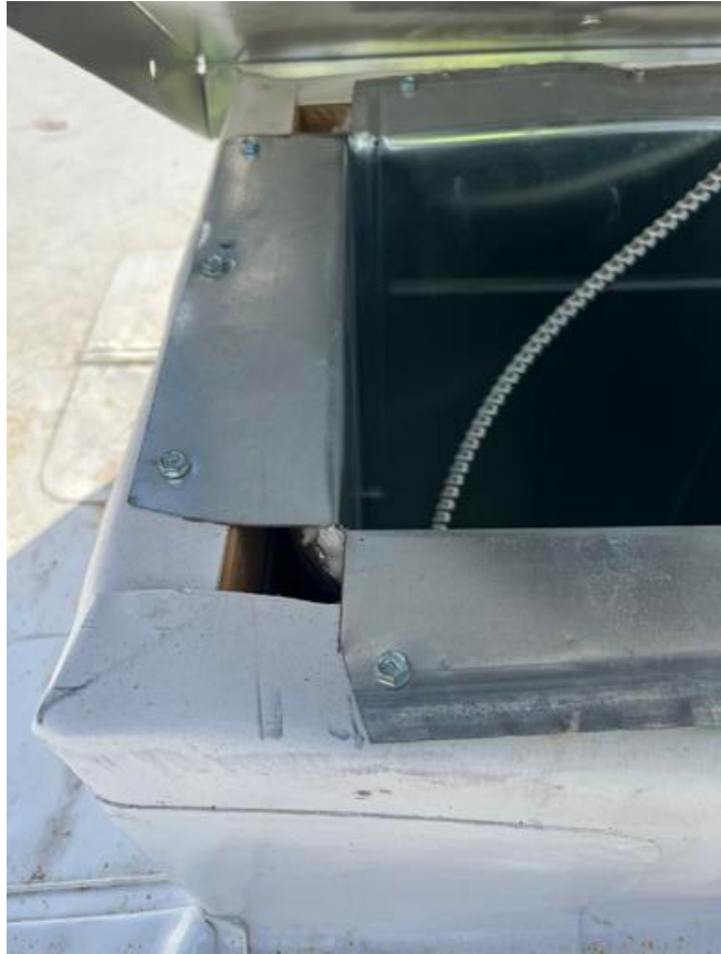
IMG_9136 Stephen Tassinaro Dec 23, 2025 6:52 PM