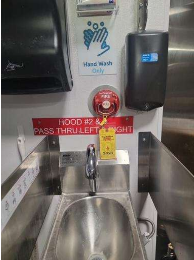
004 Cole Miller May 28, 2025 2:11 PM