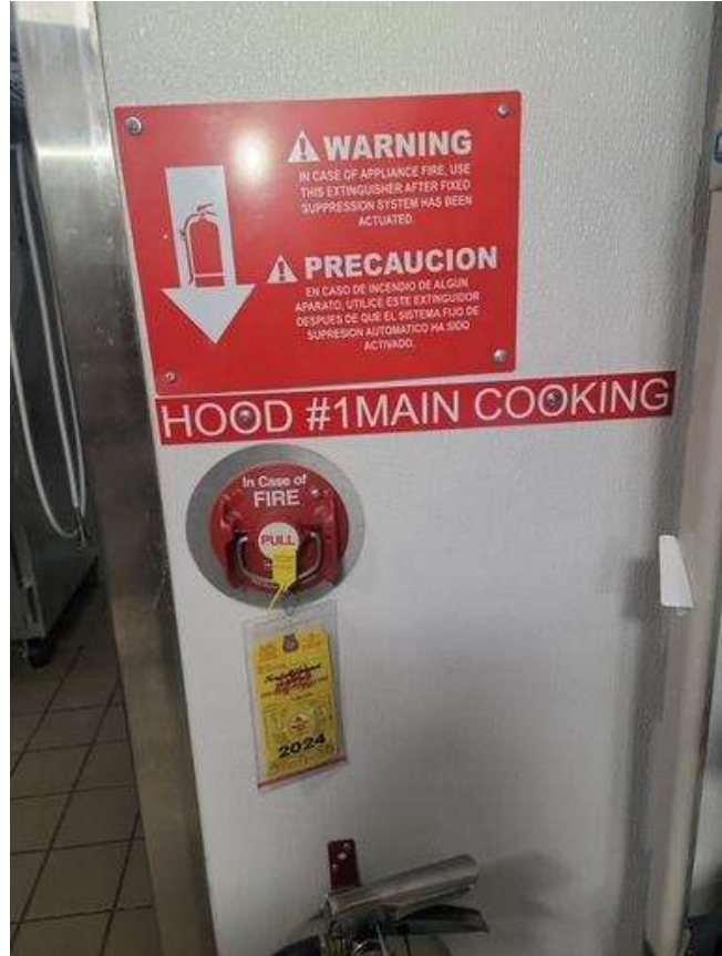
005 Cole Miller May 28, 2025 2:05 PM