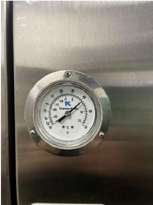
IMG_7056 Dale Wheeler Feb 17, 2025 7:10 PM