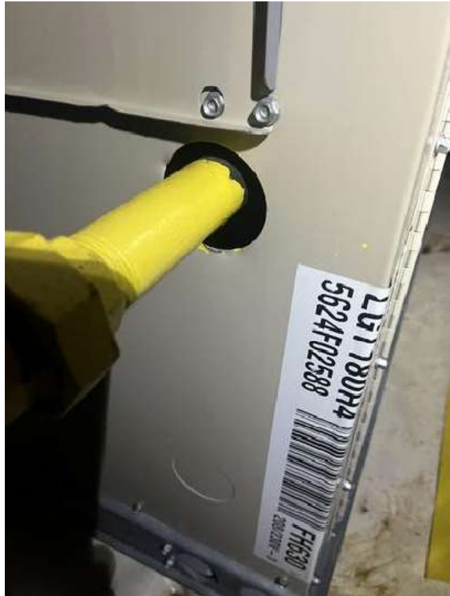
IMG_7031 Dale Wheeler Feb 17, 2025 7:12 PM