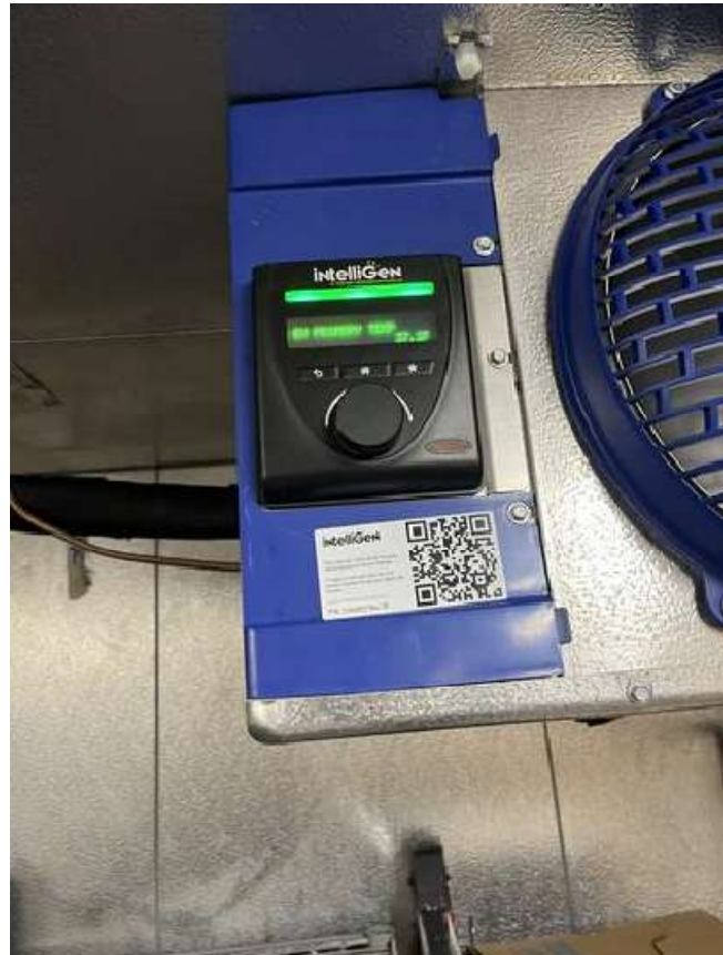
IMG_7057 Dale Wheeler Feb 17, 2025 7:10 PM