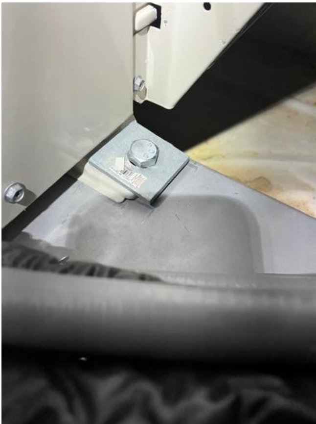
IMG_7044 Dale Wheeler Feb 17, 2025 7:09 PM