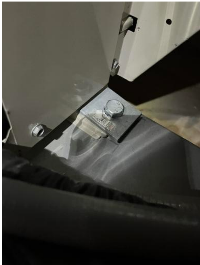
IMG_7043 Dale Wheeler Feb 17, 2025 7:09 PM