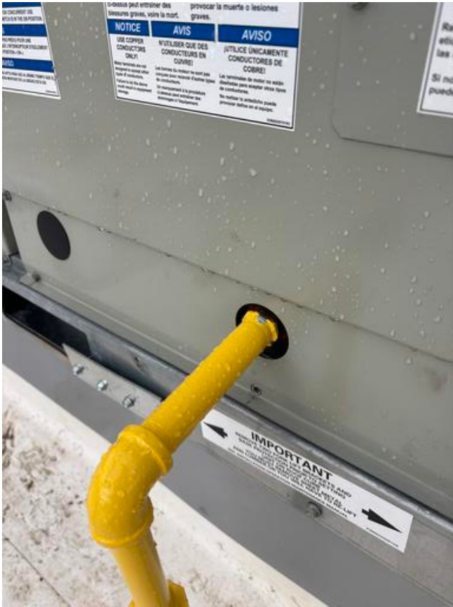
IMG_1014 Kalen Kemp Aug 19, 2025 6:46 AM