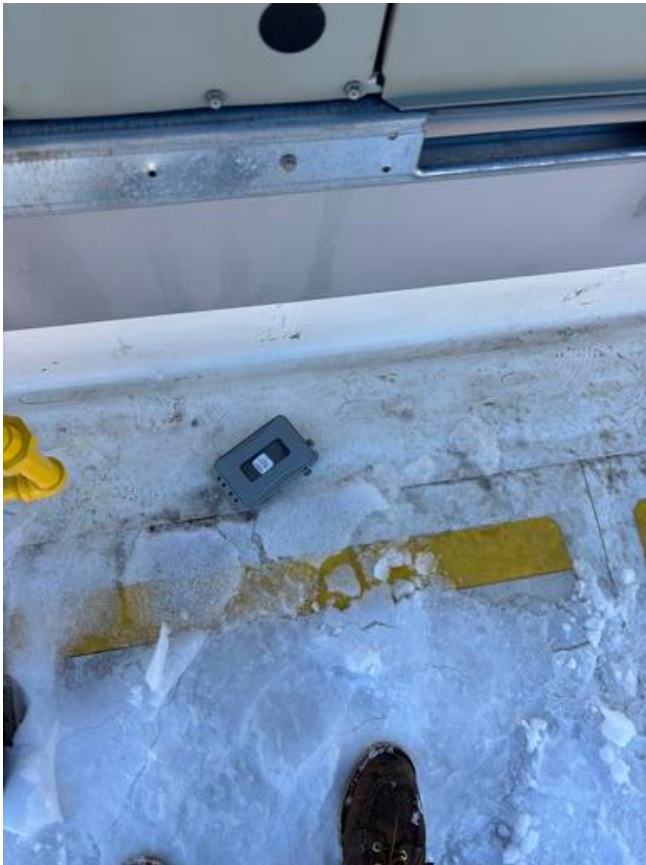
IMG_3651 Kalen Kemp Feb 1, 2026 3:17 PM