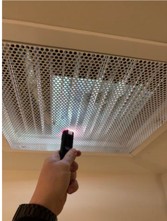
IMG_3600 Kalen Kemp Feb 1, 2026 8:20 AM