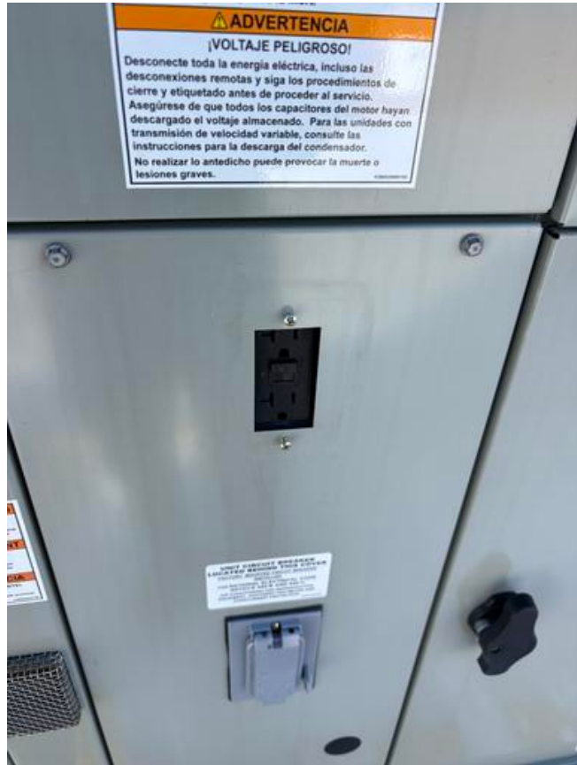
IMG_3650 Kalen Kemp Feb 1, 2026 3:17 PM