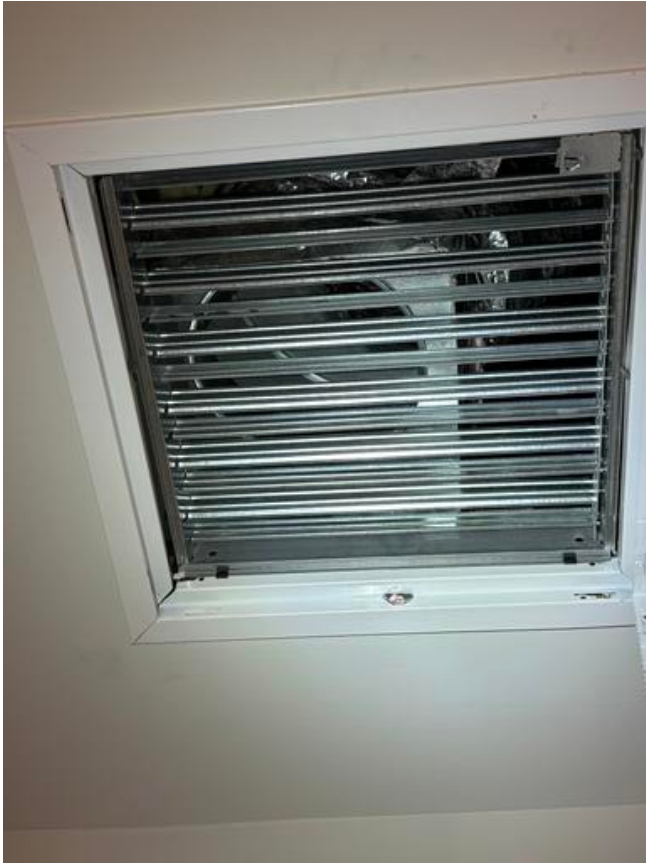
IMG_3603 Kalen Kemp Feb 1, 2026 8:36 AM