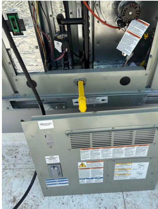
#264 Kirk Hutchins Sep 3, 2025 10:17 AM