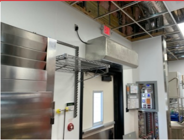
AIR DOOR #2