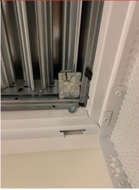
FACE DAMPER MARKED