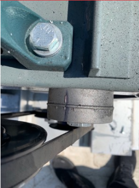
EF BELT TENSIONER MARKED