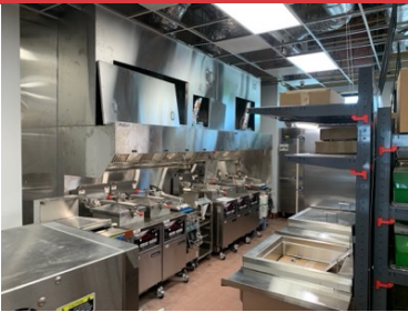
HOOD 1 L&R