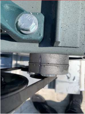
EF BELT TENSIONER MARKED