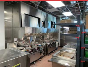
HOOD 1 L&R