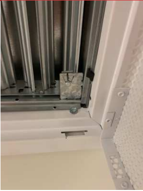
FACE DAMPER MARKED