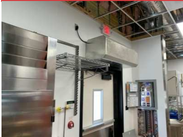
AIR DOOR #2