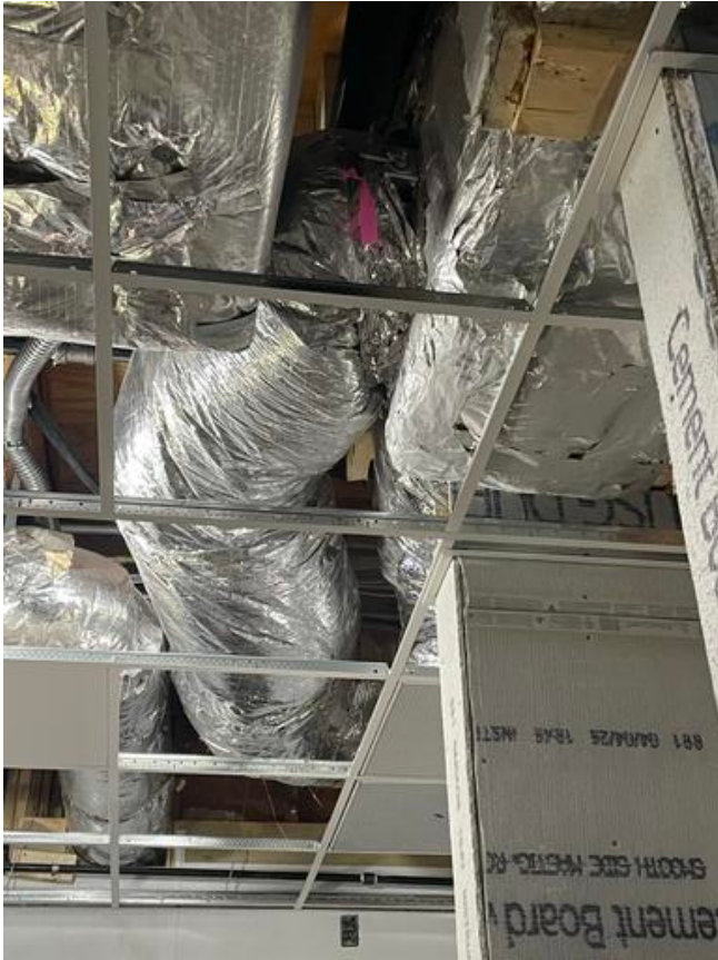
IMG_6991 Jun 23, 2025 2:23 PM