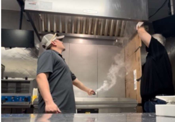
End panel mockup on main griddle

The fryer hood capture is now poor. Reducing the MUA should help. But quarter end panels are also recommended. Full vertical end panels would be ideal if they don't effect Operations.