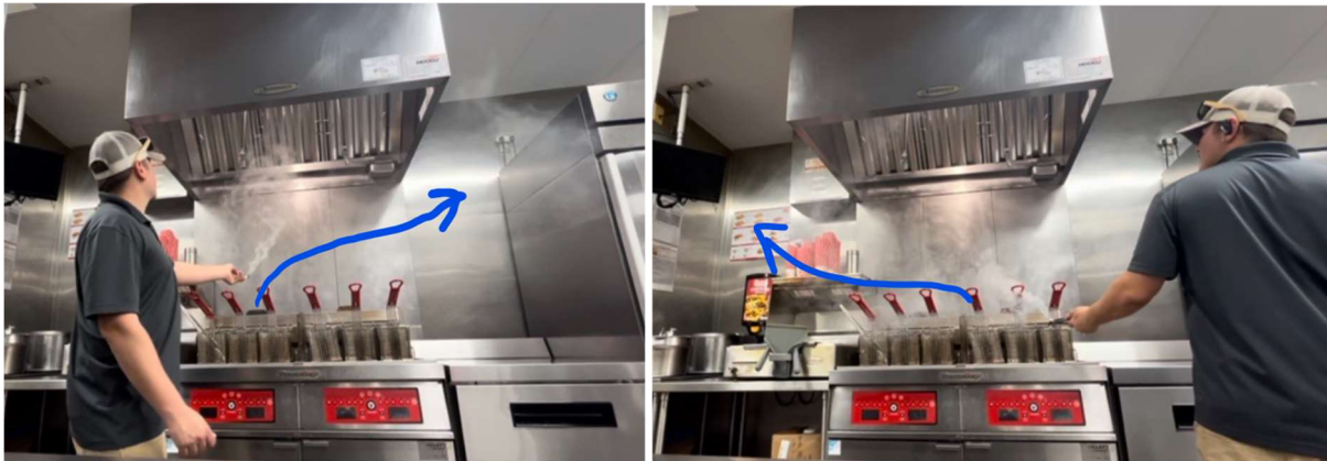
Fryer smoke capture loss

The fryer hood capture is now poor. Reducing the MUA should help. But quarter end panels are also recommended. Full vertical end panels would be ideal if they don't effect Operations.