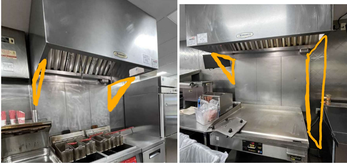
Recommend end panel locations

See following pages for additional insight into additional maintenance items that were found on site.