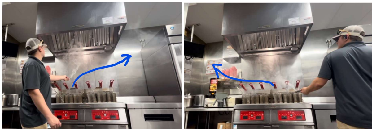
Fryer smoke capture loss

The fryer hood capture is now poor. Reducing the MUA should help. But quarter end panels are also recommended. Full vertical end panels would be ideal if they don't effect Operations.