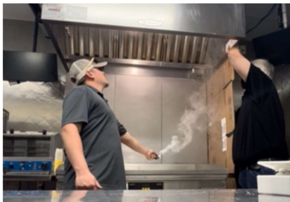
End panel mockup on main griddle

The fryer hood capture is now poor. Reducing the MUA should help. But quarter end panels are also recommended. Full vertical end panels would be ideal if they don't effect Operations.