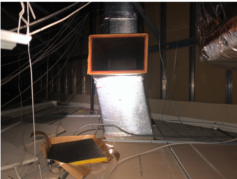
DUCTWORK FOR GRILLE NEAR PICKUP AREA DOOR IS OPEN. LARGE AMOUNTS OF SUPPLY AIR FROM RTU-1 LEAKING INTO CEILING SPACE.