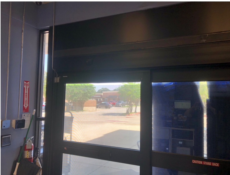
PICKUP DOOR IS MISSING AIR CURTAIN.