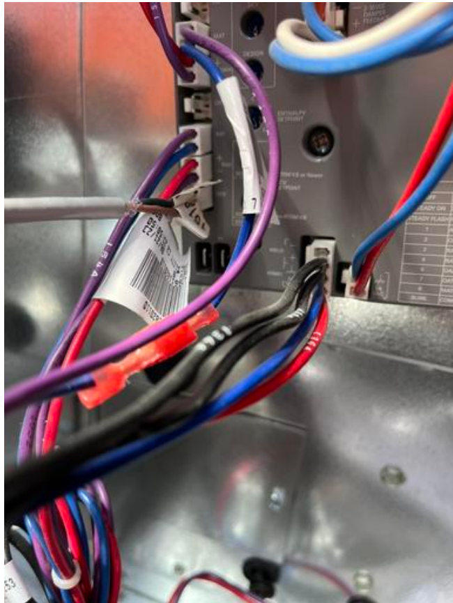
IMG_8874 Jacob Davidson Aug 27, 2024 10:00 AM